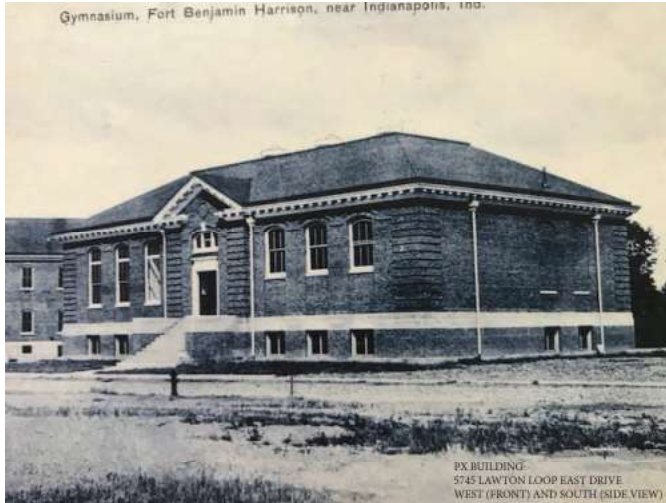
View from the southwest