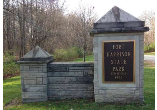
1,700-acre State Park