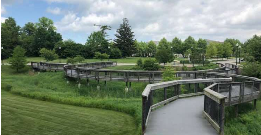
Green, walkable campus with master drainage