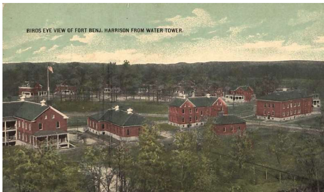
Historic Postcard of Lawton Loop