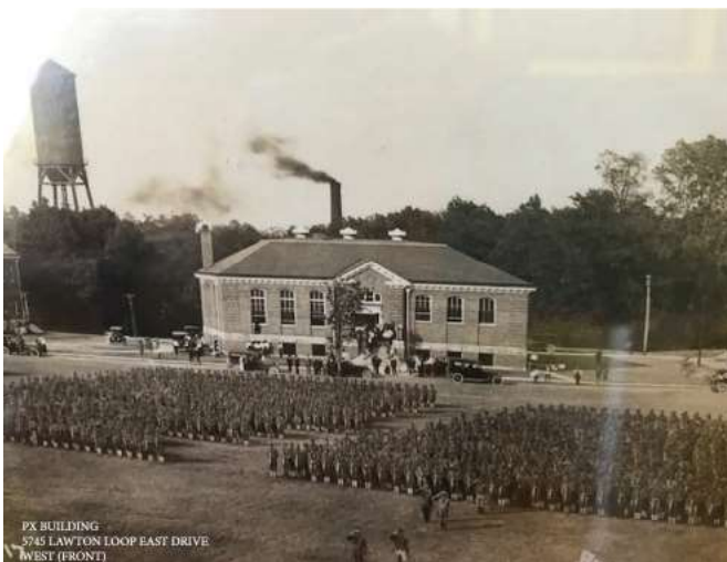
Historic photo of soldiers on parade grounds in front of PX