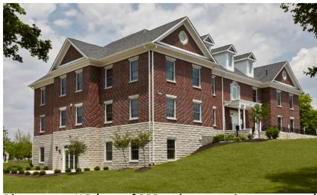
BloomingHQ (one of 298 tech companies on campus)