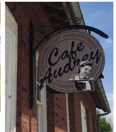
11 locally owned restaurants