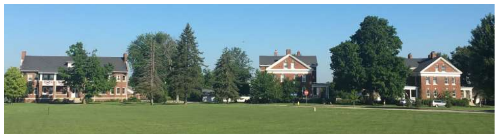
View of Lawton Loop West homes across parade grounds