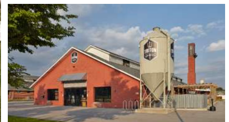
Triton Brewery and Bistro