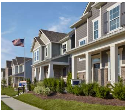
New single-family homes on campus