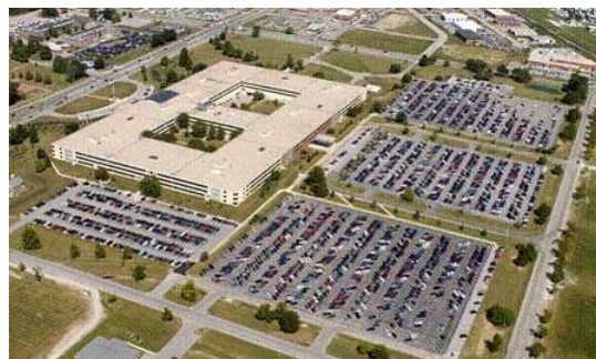
5,000+ employees at DFAS