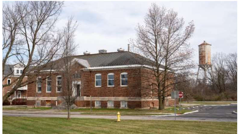
5745 Lawton Loop East Drive on 0.8-acres

Located in the historical Lawton Loop district of "Fort Ben," the PX building was originally built in 1908 as the Fort Benjamin Harrison Army Base PX (Post Exchange store) and featured a basement gymnasium for soldiers. Later, when a new PX was built, the building was converted to a non-commissioned officers club. Today it is a brick and beam historic shell waiting for a new life.