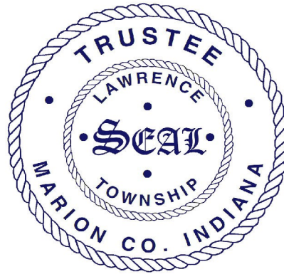
Office of the Lawrence Township Trustee, 4455 McCoy St. Lawrence IN 46226, (317) 890-0011

After submitting an application, someone from the office will contact you to schedule an appointment with a Case Manager.